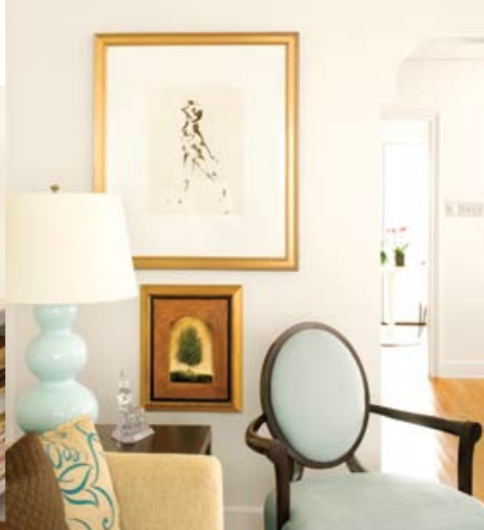
LEFT: Shelves below the window hold books and display art. ABOVE: The pen-and-ink drawing could have seemed too large for the painting underneath, but it works because the smaller piece is hung low. BELOW: The “plant” is actually a sculpture made from a dragonwood tree branch with leaves consisting of rolled and waxed paper.